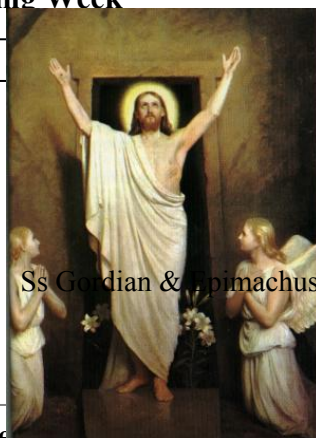
Ss Gordian & Epimachus